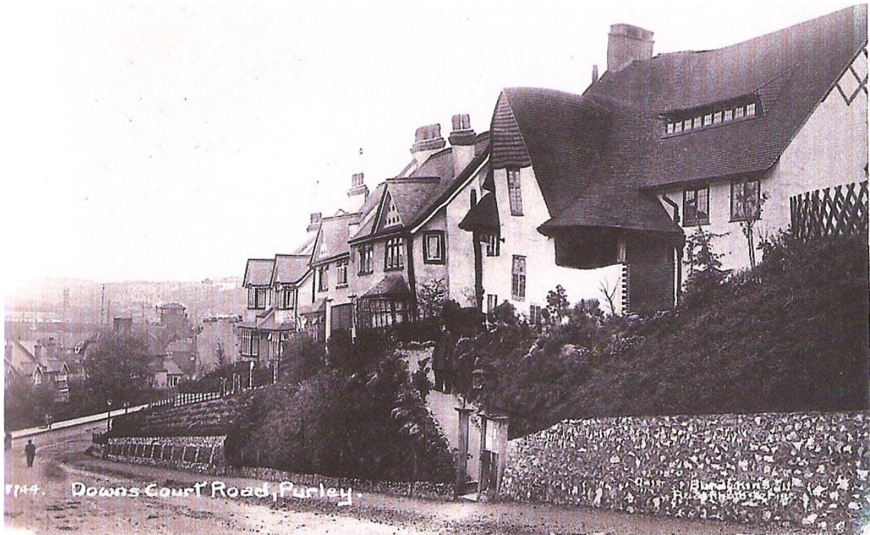
Figure 1: The meeting house as newly built, c.1909

Purley Meeting House was built in 1909, from designs by George Pepler of Pepler & Allen, at a cost of £1,600. A photograph of its original appearance is shown at figure 1 (the apparent dip in the ridge is thought to be due to the plate being moved in the camera during exposure, rather than any inherent design fault; this and the overhanging eaves almost give the impression of a thatched roof, but the building was always tiled). The main room seated 160, and had a folding screen to create a separate lobby. Butler describes the original provision for the warden as 'rather inadequate'; this part of the building was adapted and extended in 1985-8 at a cost of £60,000 (architect John Marsh of the Marsh, Eddison, Brown Partnership, London WC2, Surveyor to Six Weeks Meeting).